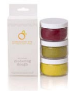
NATURAL modeling dough